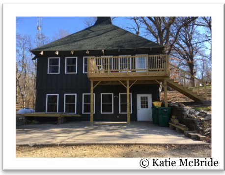
December 2020 – the change is dramatic

The whole face of the building was rot & needed new framing.