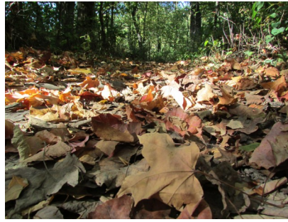
Scenery from Pioneer Pass trail

A walk on Mill Springs trail, which has 1776ft of pave- ment & is surrounded by beauty.